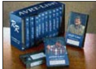
• AVRT: Live! shows AVRT-based recovery, A to Z. • The Beast Came Back (not shown) is a review of AVRT® for a "relapsed" alcohol and drug addict.

If you can't make it for AVRT: The Course, get the full AVRT® curriculum on DVD/VHS! Special productions for "tough cases" now exist for people who have a history of difficulty in addiction treatment or who have long exposure to recovery groups.